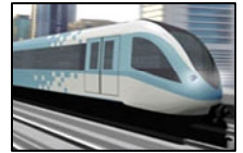
Dubai RTA Rail Agency Dubai, UAE