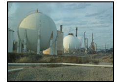
Coffeyville Resources Refinery USA