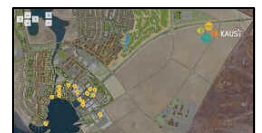
King Abdullah University (KAUST) Kingdom of Saudi Arabia