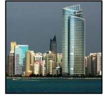
ADIA HQ Tower Abu Dhabi, UAE