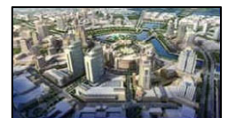
King Abdullah Economic City Kingdom of Saudi Arabia