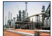
Nigerian National Petroleum Corp Nigeria