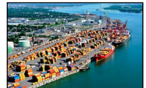
Port of Montreal Canada