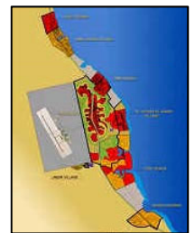
M.A. Kharafi's Port Ghalib Red Sea, Egypt