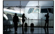
JFK Airport NYC, NY - USA